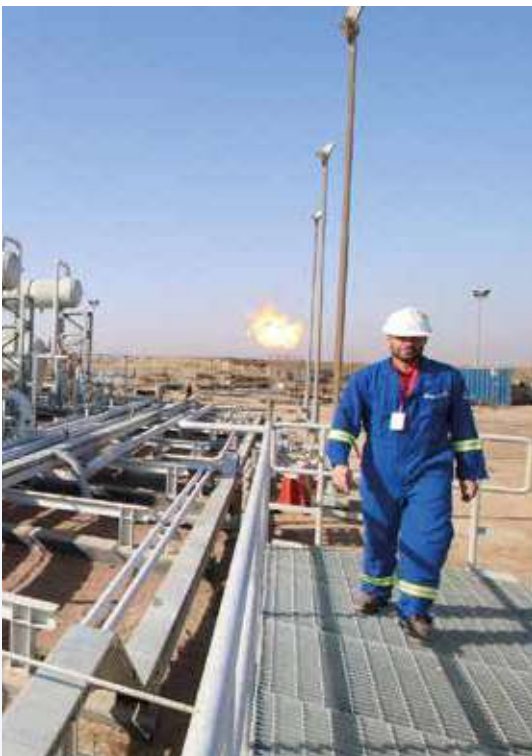
Fig 01.1 Oil Field – Iraq

OIGATECH 2024 is focused on the dissemination of new and current technology, best practices and multi-disciplinary activities designed to emphasize the importance of the value chain and maximizing asset value. The knowledge, capabilities and strengths of the participating countries and the sponsoring societies global membership, over the spectrum of multi-disciplinary technologies, are central to the success of the exhibition, Technologies are evolving at an unprecedented pace and present a significant advantage to energy companies that integrate them into their operations to drive business transformation, accelerate decision making and address decarbonization of operations,