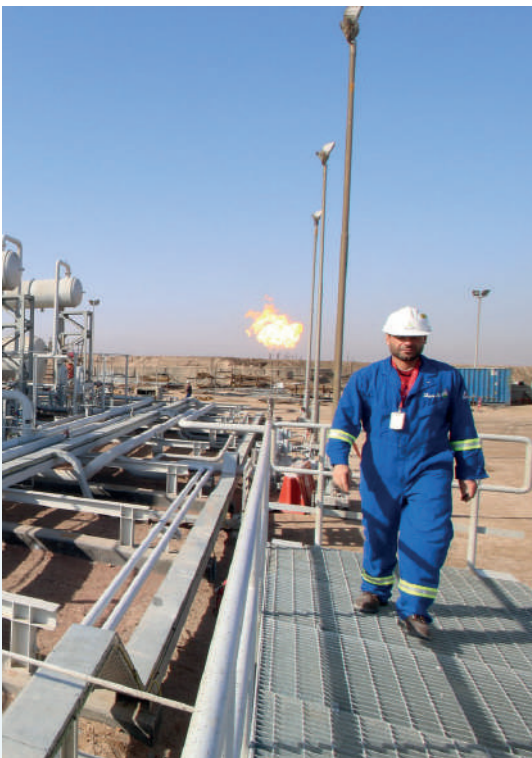
Fig 01.1 Oil Field – Iraq

OIGATECH 2024 is focused on the dissemination of new and current technology, best practices and multi-disciplinary activities designed to emphasize the importance of the value chain and maximizing asset value. The knowledge, capabilities and strengths of the participating countries and the sponsoring societies global membership, over the spectrum of multi-disciplinary technologies, are central to the success of the exhibition, Technologies are evolving at an unprecedented pace and present a significant advantage to energy companies that integrate them into their operations to drive business transformation, accelerate decision making and address decarbonization of operations,